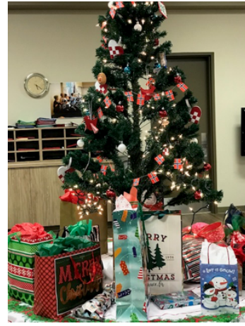
Some pic. from our Christmas Dinner Dec. 18