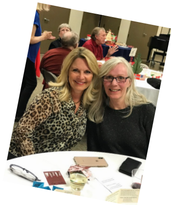
Our 9 members, present with awarded pins