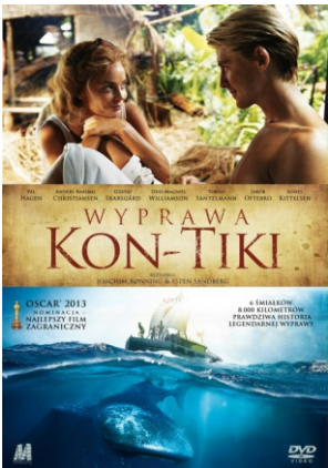
Kon-Tiki (2012) The Movie

Heyerdahl believed that people from South America could have reached Polynesia during pre-Columbian times. His aim in mounting the Kon-Tiki expedition was to show, by using only the materials and technologies available to those people at the time, that there were no technical reasons to prevent them from having done so. Although the expedition carried some modern equipment, such as a radio, watches, charts, sextant, and metal knives, Heyerdahl argued they were incidental to the purpose of proving that the raft itself could make the journey. This idea has received support from statistical analysis of genetic evidence of contact between South America and Polynesia.