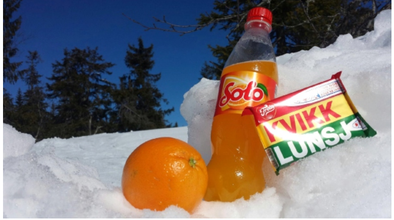
How Norwegians celebrating Easter