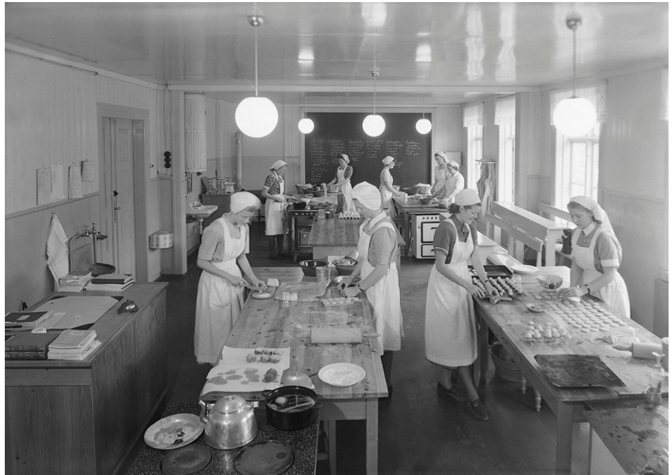
Trondheim Kommunale Husmorsskole (Trondheim Home Economics School)