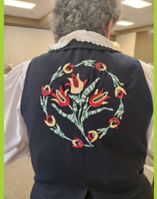
Palm Springs Bunad